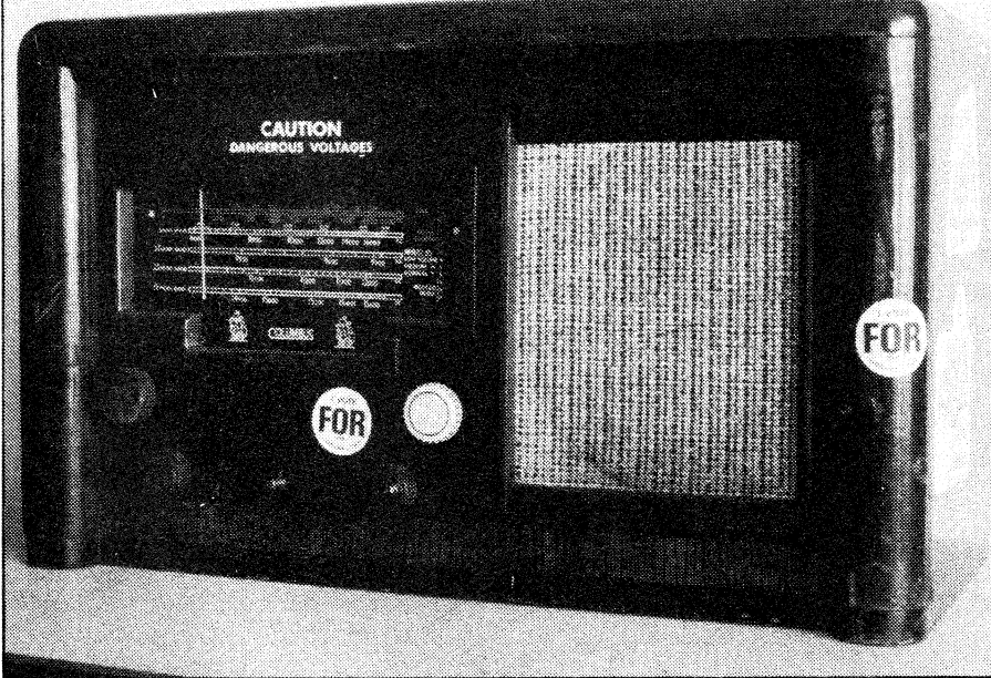
The author's Columbus 90 mantel model, before cabinet restoration. It dates from the 1940's. Note the scratched lacquer and stickers plastered over the cabinet.

the radio is working, I suggest that all paper and electrolytic capacitors as well as resistors should be checked with a meter. Replacements are inexpensive and any suspicious characters should be renewed.