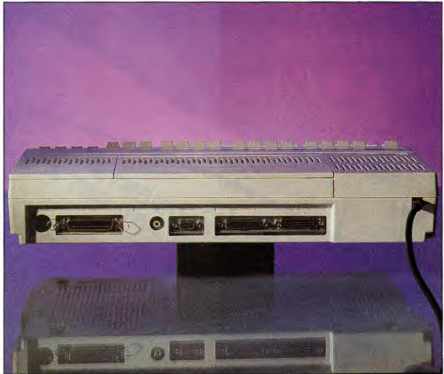
From left to right: external disk power and signal connectors, TV and monitor sockets, parallel and serial ports

monitor. In 40-column mode the individual characters were very dense and clear, and when I switched to 80 columns I was pleasantly surprised by the legibility of the display.