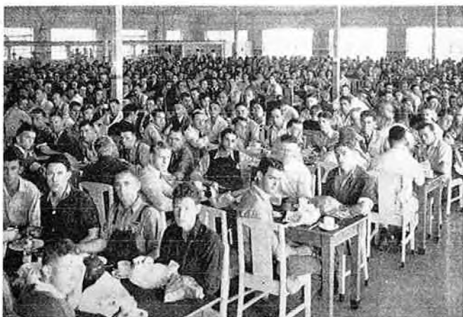
This war-time photo shows the AWA Works Cafeteria at Ashfield. Meal breaks were staggered to cater for the large staff numbers involved and for shift workers.