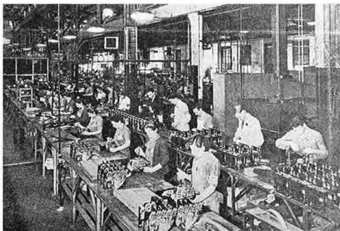
A general view of one of the assembly lines in the Radio Electric Works, at AWA's Ashfield factory. Many types of transmitters and receivers were built here during the war.

used in several pieces of equipment manufactured by AWA in the 1940s. If this proves faulty, it should be possible to find a replacement although it may take some tracking down. This usually won't be necessary though because it has proved to be reliable.