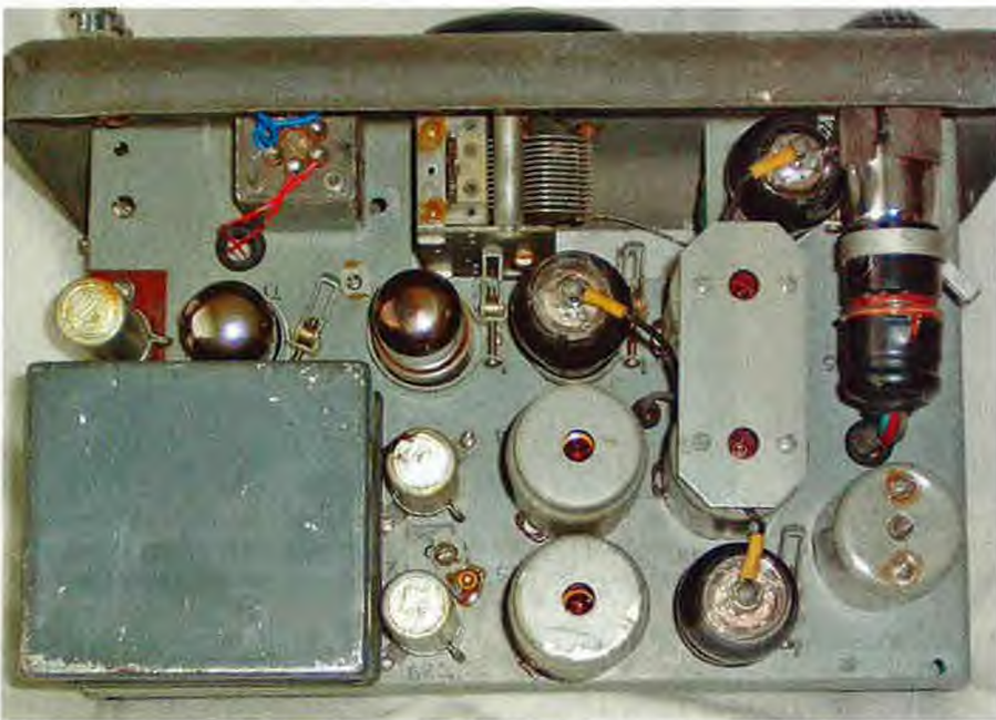
This top view of the chassis shows the robust construction techniques used in the R7077. The valves are all held in place by clamps, so that they cannot come loose as the unit is moved about.