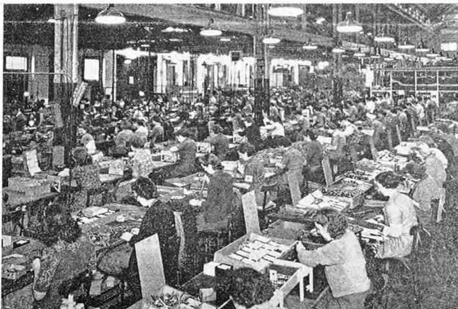
This photo shows workers building sub-assemblies on another of AWA's war-time production lines.

In my case, I often use the restored R7077 BFO as an external modulation source for a signal generator, when checking the audio response of radio sets. The audio range is covered in one sweep of the dial. Besides, it is interesting to preserve some Australian electronic history. SC