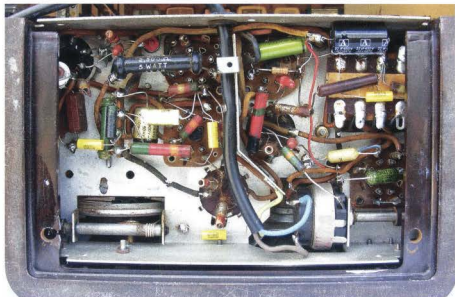
This view of the model 112A shows just how few parts there are underneath the chassis. Note that this photo was taken before the power cord was rewired and properly clamped into position (the Earth connection was also later improved).

When aligning the receiver, this plate antenna must be attached and the back panel fitted in place as it affects the antenna input tuning adjustments