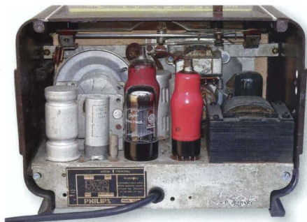
The view inside the model 112A receiver. The chassis is well laid out and all parts are readily accessible.

The local oscillator is based around V1, coils L3 and L4, the other section of the tuning gang (C4) and their associated components. The values