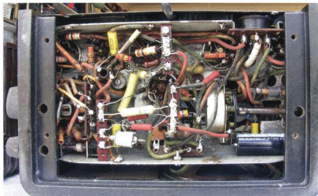
The Dutch 209U's chassis is more crowded than the model 112A's and is further complicated by the hand-switching arrangement at lower left. As a result, it's the more difficult of the two sets to service.

at the high-frequency end of each tuning range.