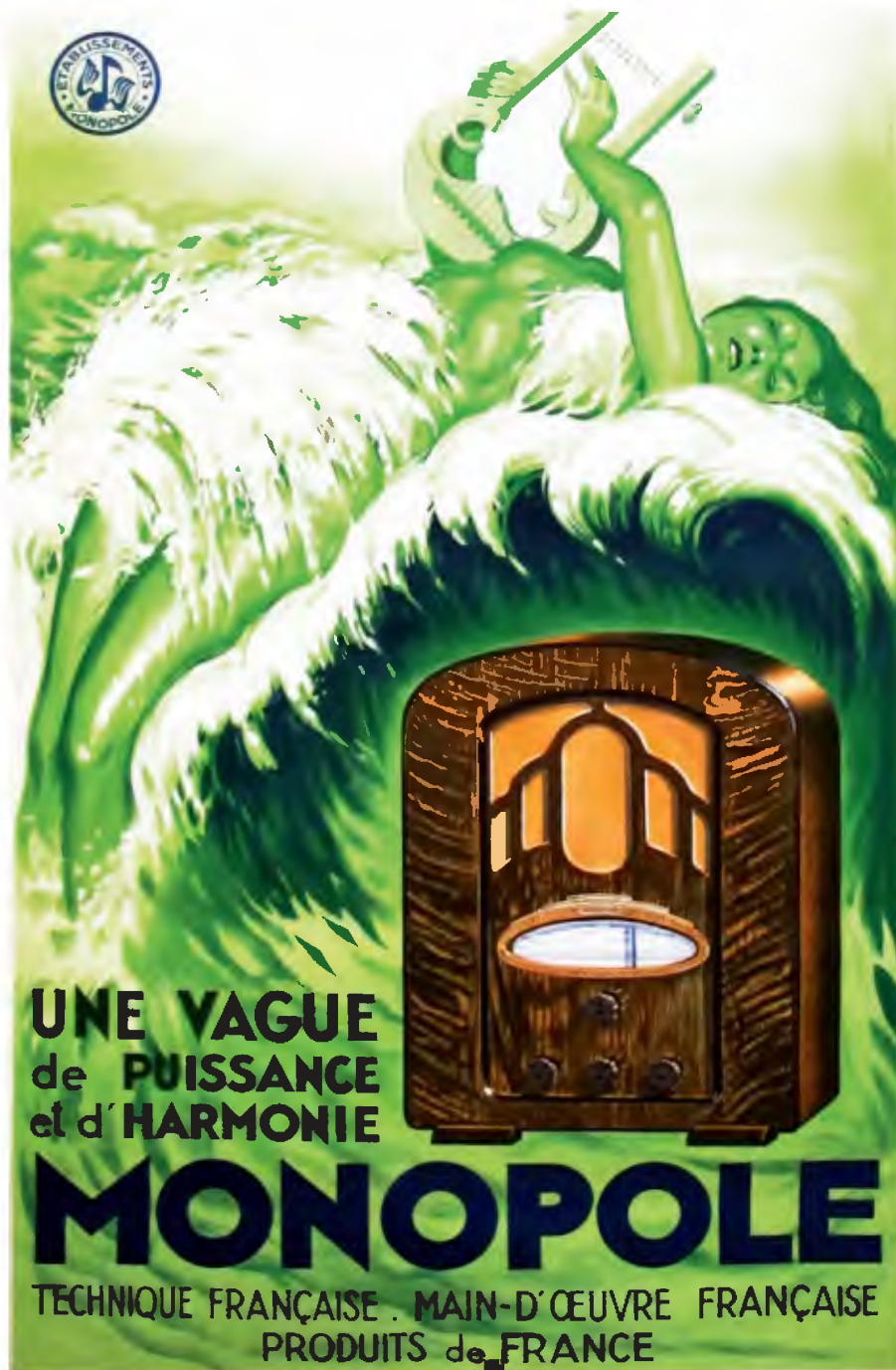
A French advertising poster showcasing the D225 radio. The advert is stated to be from “Damour-Editions”, and measures 120cm high and 80cm wide.

The earlier chassis photo had the transformer cover removed so that its windings and laminations could be seen. This is what it looks like with the ventilated cover in place.