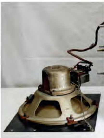
This speaker was not original, it was instead an Australian-made 8-inch Rola speaker of the same vintage.