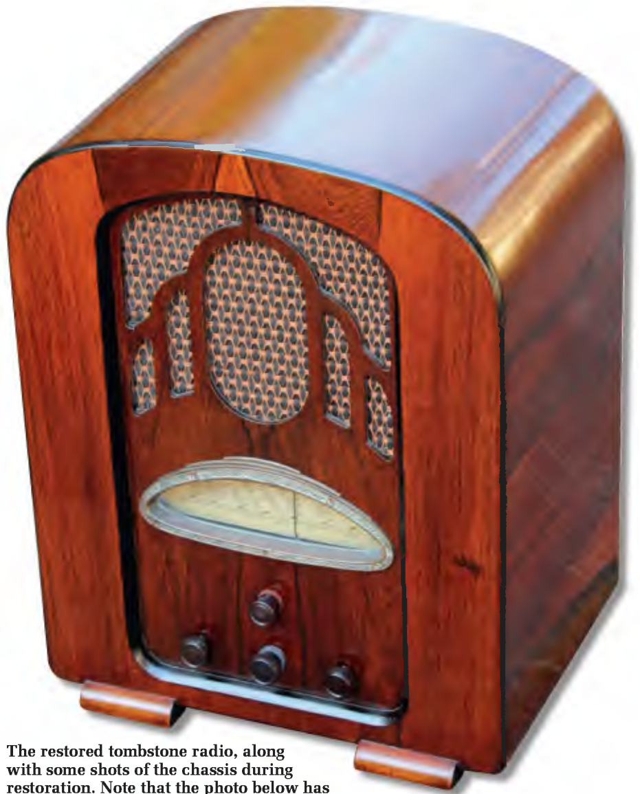
The restored tombstone radio, along with some shots of the chassis during restoration. Note that the photo below has the dial already repaired.

The full-wave rectifier was type AZ1. The high tension filter choke is the field coil of an electrodynamic speaker.