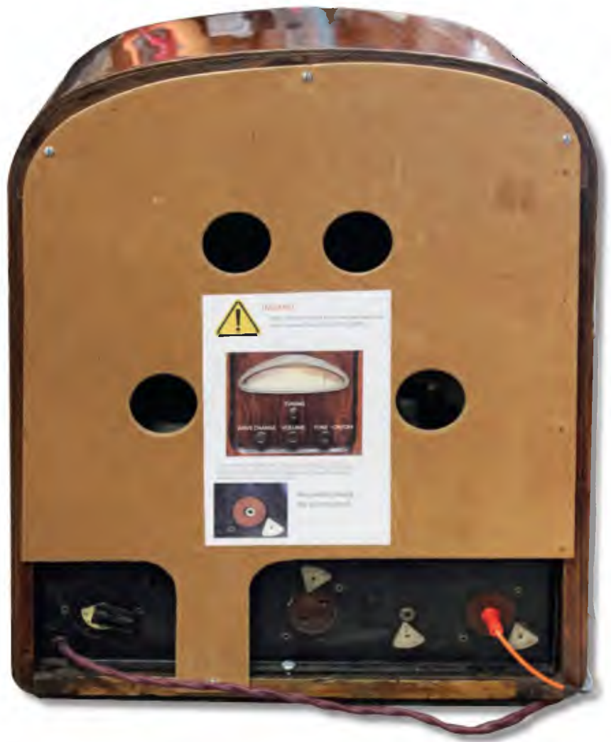
This shows the rear panel and label I fabricated. Also present are (from left-to-right) the power cord, mains voltage selection switch, speaker socket (hidden), a 'pickup' audio input socket, Earth connection and antenna connection.

The radio produced excellent sound, with the speaker now baffled in its resplendent cabinet. SC