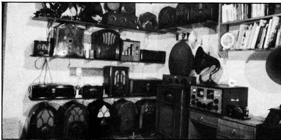
Part of the author's own collection of vintage receivers.