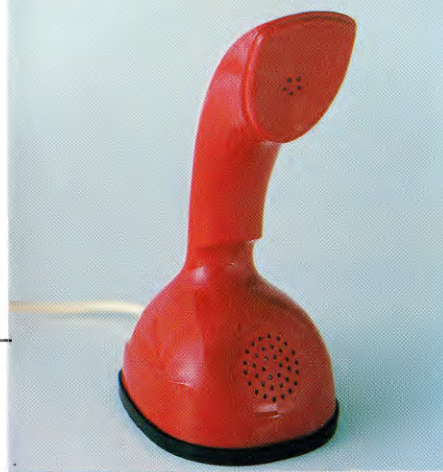
ERICOFON Surf Green, Carnival Red, Ivory, Silver Grey, Mushroom.