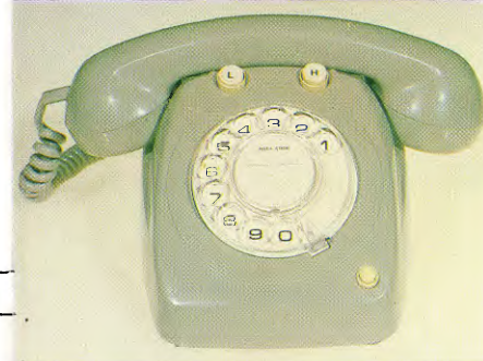
TWO LINE TELEPHONE (Mist Grey only)