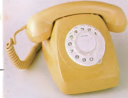
COLORFONE Topaz Yellow, Lacquer Red, Light Ivory, Fern Green, Mist Grey.