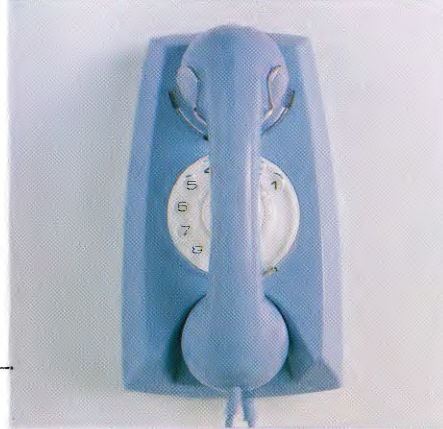
WALLFONE Appliance White, Powder Blue, Black.